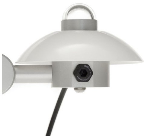
Figure 4 RA01 2-component radiometer in detail: pyranometer model SR01

Applicable instrument-classification standards are ISO 9060 and WMO-No.-8; Guide to Meteorological Instruments and Methods of Observation.