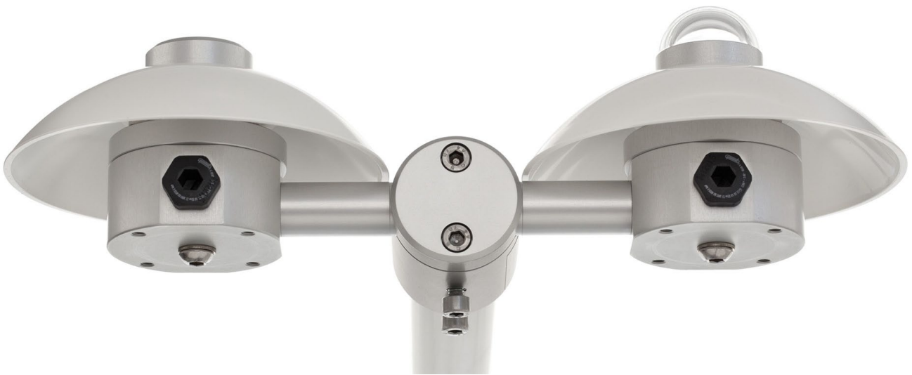
Figure 1 RA01 2-component radiometer

RA01 is a market leading 2-component radiometer, mostly used in scientific-grade energy balance and surface flux studies. It offers 2 separate measurements of solar and longwave radiation. Product features include a modular design, low weight, and easy levelling, and low solar offsets in the longwave measurement. The unique capability to heat the pyrgeometer reduces measurement errors caused by dew deposition. When combined with estimates of solar albedo and of local surface temperature, this instrument can also be used for estimation of net radiation. The advantages of this approach are cost reduction and independence from local surface properties.