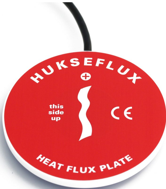
Figure 1 HFP01 heat flux plate; the opposite side has a blue coloured cover

HFP01 is the world's most popular sensor for heat flux measurement in the soil as well as through walls and building envelopes. The total thermal resistance is kept small by using a ceramics-plastic composite body. The sensor is very robust and stable. It is suitable for long term use on one location as well as repeated installation when a measuring system is used at multiple locations.