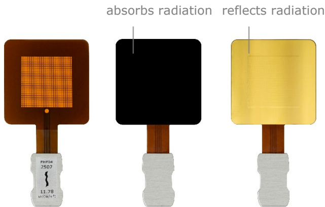
Figure 3 example: FHF04 foil heat flux sensor without and with BLK-5050 and GLD-5050 stickers applied to it