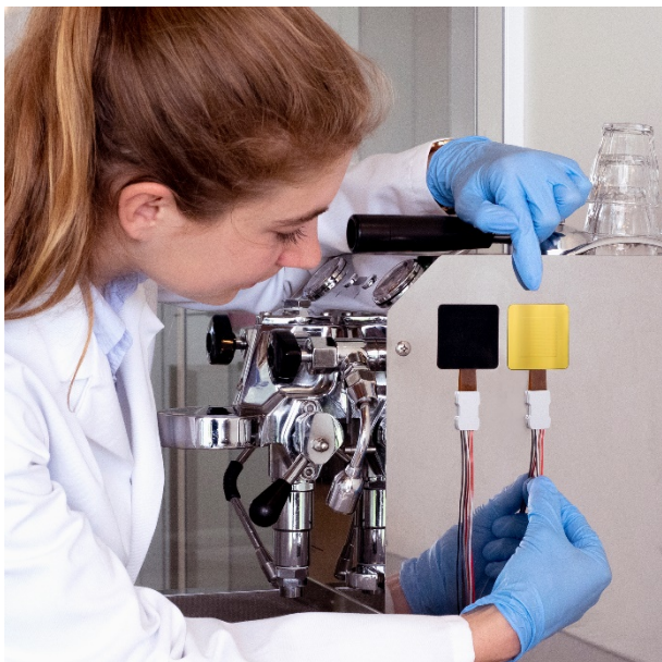
Figure 2 measuring with BLK - GLD stickers; application of a BLK black sticker and a GLD gold sticker on an FHF-type sensor for measuring radiative and convective heat flux.