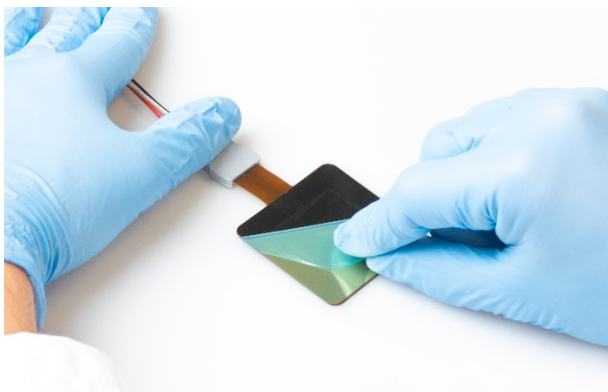
Figure 5 BLK – GLD sticker series are designed to be easily applied by the user. Pre-application to the sensor of your choice at the factory is optional.